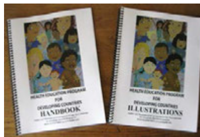
B-1: Coil Binder