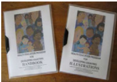
A: Report Cover

See photos. The coil binder version is also produced in a Combined version that includes both the Handbook and the Illustrations in a single volume (B-2). All versions enable the presenter or facilitator to consult the Handbook while simultaneously demonstrating the corresponding Illustration. The combined single volume version (B-2) is currently the most popular (Simply delete the two colored cover pages for the HANDBOOK and ILLUSTRATIONS from the respective online files).